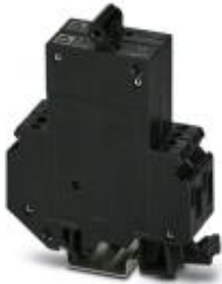
Thermomagnetic circuit breaker, 2-pos., fast blow, 1 N/O contact and 1 N/C contact, with universal foot for mounting on NS 32 or NS 35

Please be informed that the data shown in this PDF Document is generated from our Online Catalog. Please find the complete data in the user's documentation. Our General Terms of Use for Downloads are valid ( http://phoenixcontact.com/download )