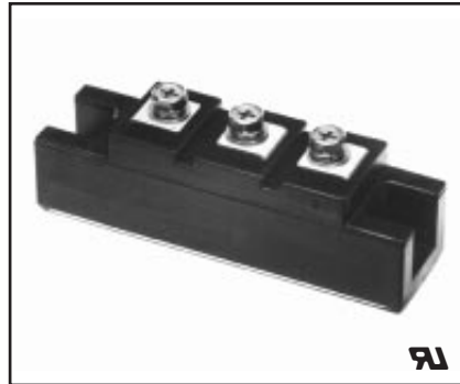
CD411230, CD411630 Dual Diode POW-R-BLOK™ Modules 30 Amperes/1200-1600 Volts